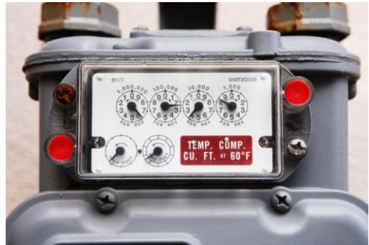
The gas piping is for residential hookups Courtesy DOE, image is in the public domain