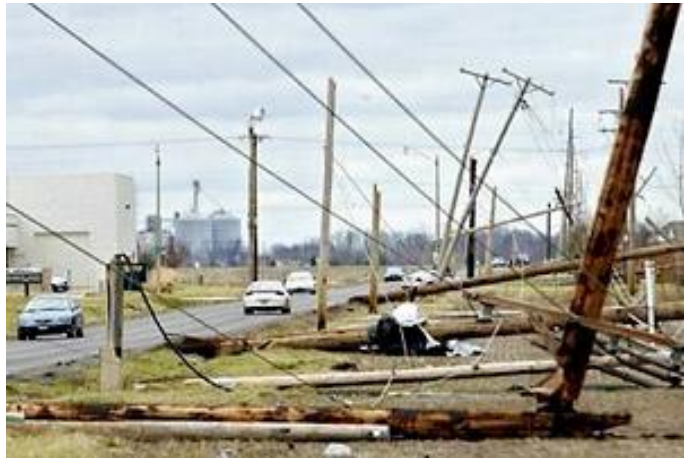
Abigail’s crew is helping with damage caused by a major storm

Courtesy OSHA, image is in the public domain