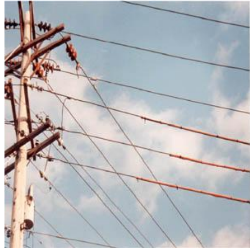
Matt and his crew are pulling wire for an overhead system