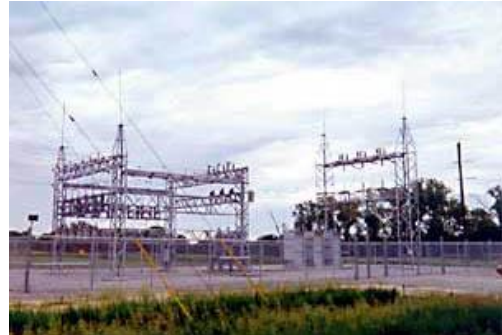
Chin is raising flow power to a substation